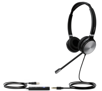
UH36 Dual Teams UH36 Dual UC