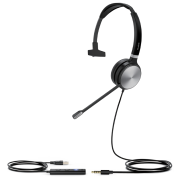
UH36 Mono Teams UH36 Mono UC

Deeply integrated with Yealink IP phones that the advanced features, such as volume synchronization and multiple calls control, are just right at your fingertips.